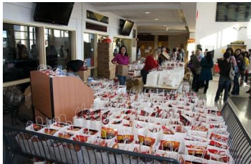
Before the door open to public ...

Pictures of the day... (More pictures at https://picasaweb.google.com/OmahaChinese/2011YearOfTheRabbit# )